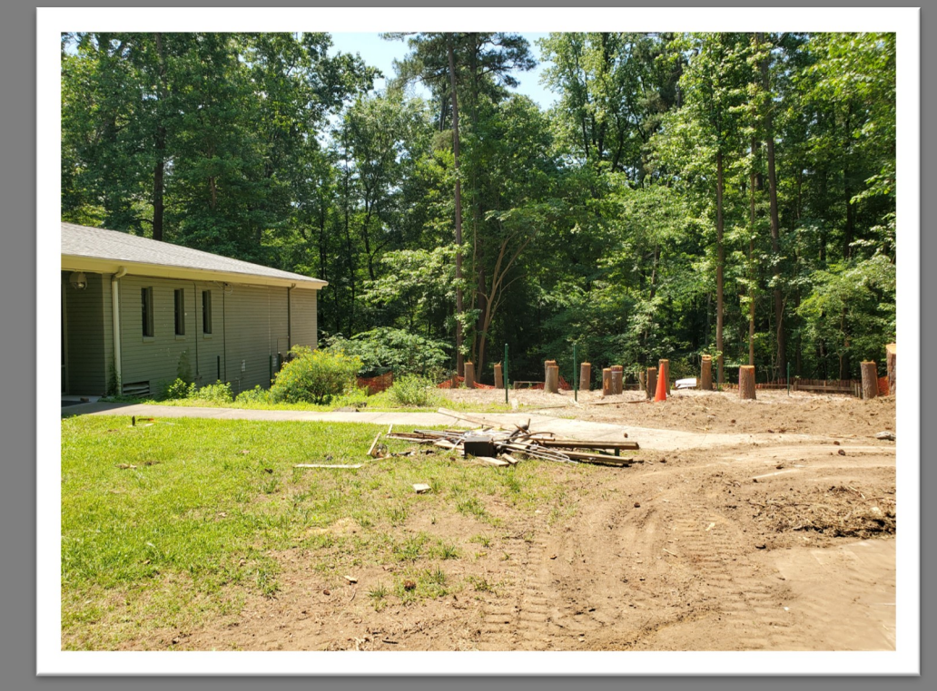
Installing temporary road, giving heavy equipment access to construction site