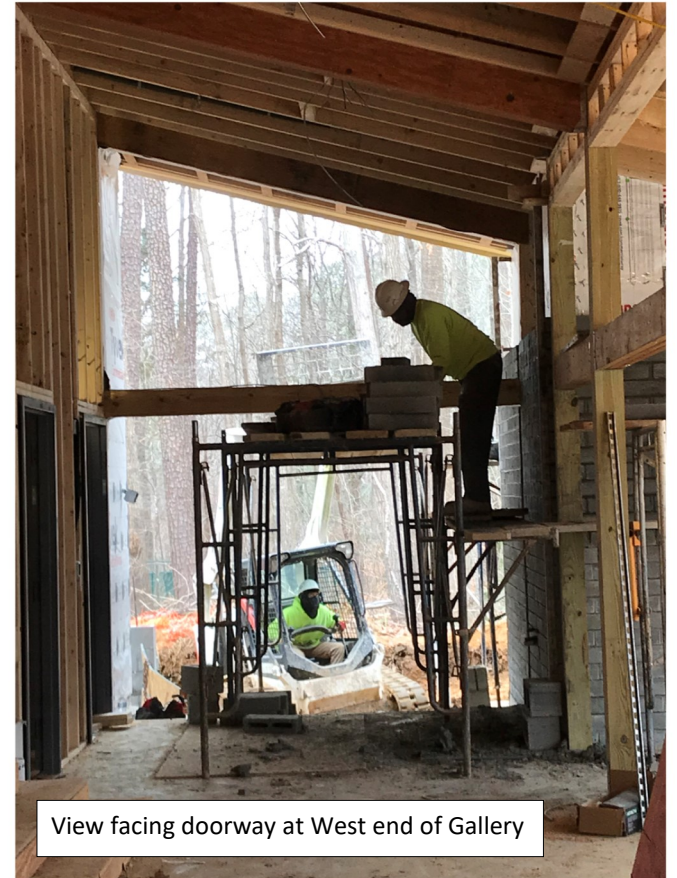
View facing doorway at West end of Gallery