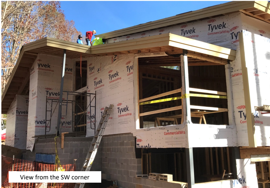
View from the SW corner