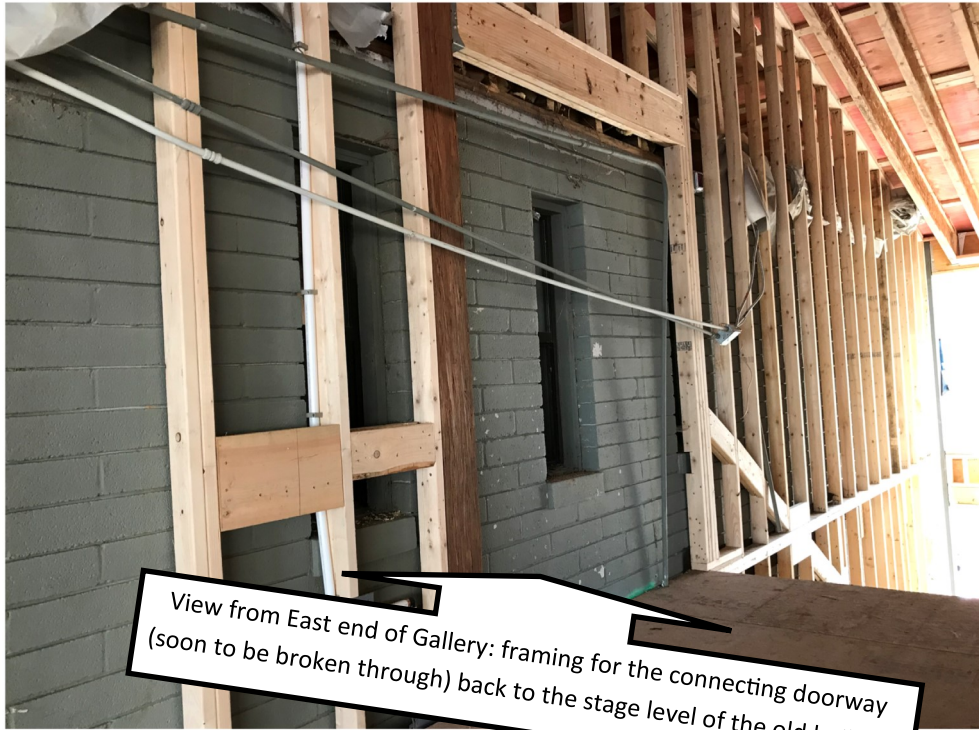
View from East end of Gallery: framing for the connecting doorway (soon to be broken through) back to the stage level of the old building

Going on this week: Continue roofing, exterior siding & trim, rough-ins for mechanical/ electrical (plumbing rough-ins passed inspection this week!), prep for hanging drywall.