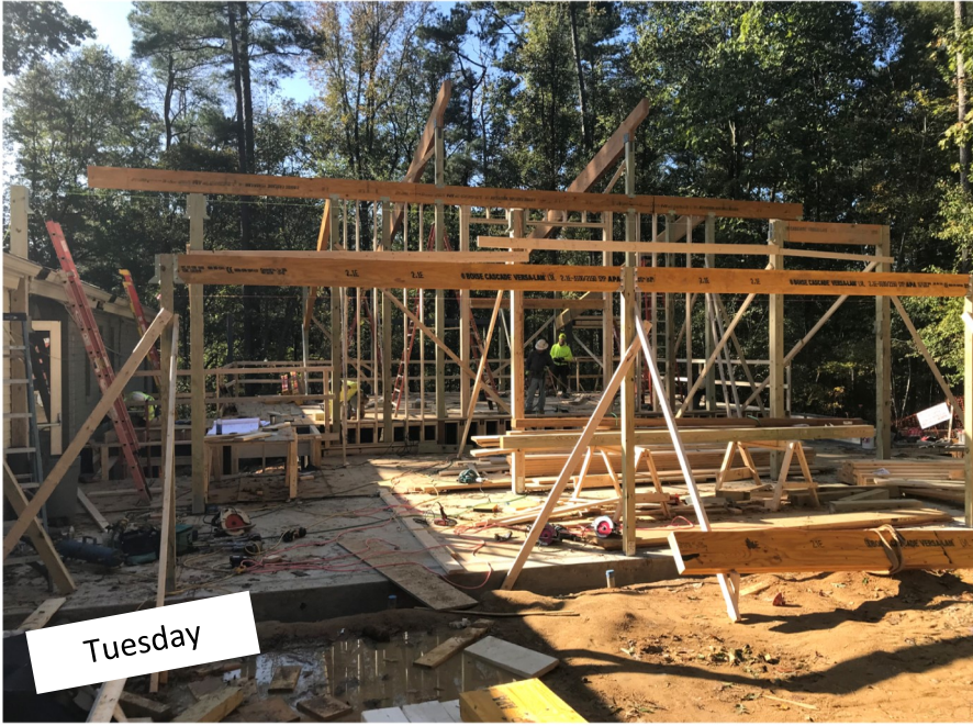
Views from N side of site, looking at Multi-Purpose Room with Gallery and Porch in foreground