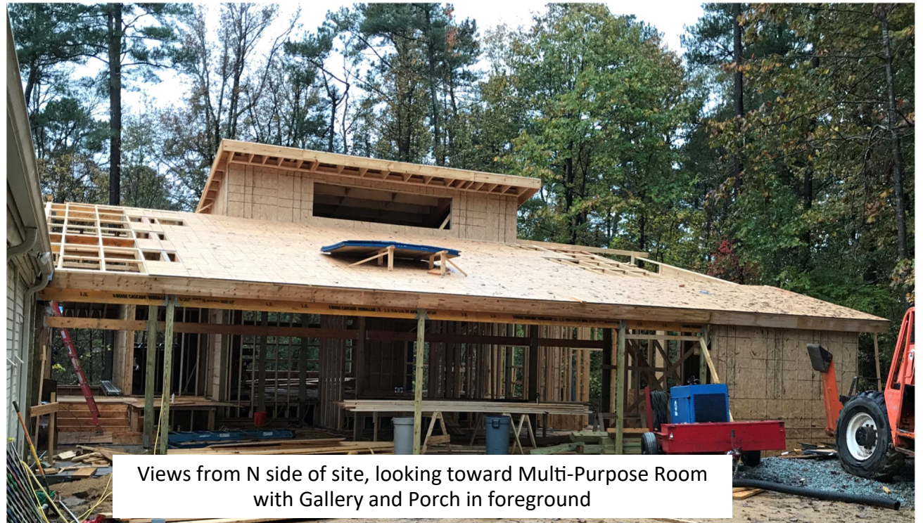
Views from N side of site, looking toward Multi-Purpose Room with Gallery and Porch in foreground