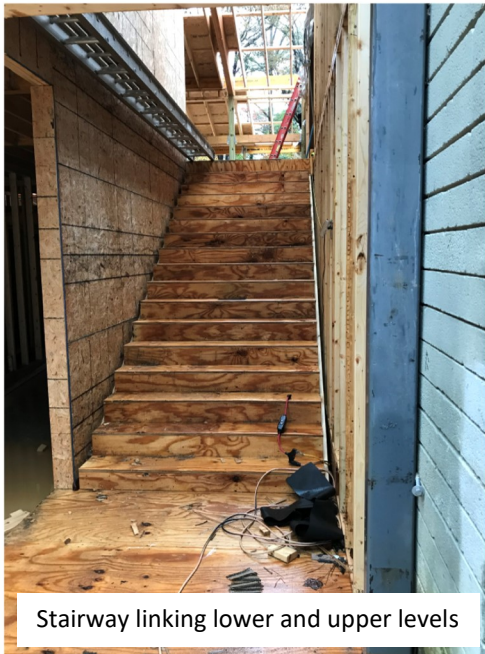
Stairway linking lower and upper levels

Going on this week: Roofing underlayment, wall sheathing, upstairs interior wall studs