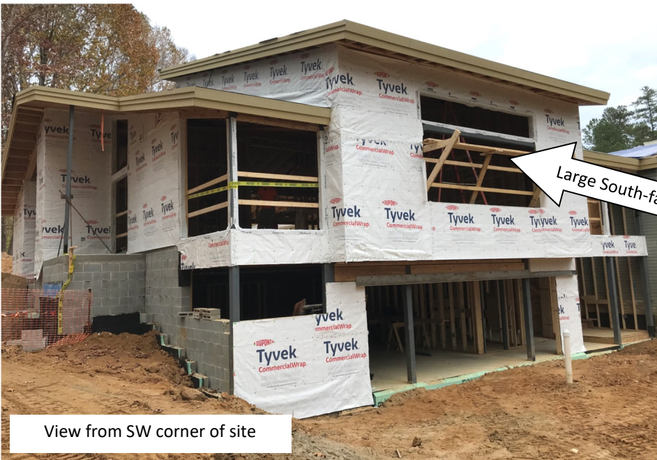
View from SW corner of site

Going on this week: Tyvek weather-proofing; plumbing, mechanical and electrical rough-ins; prep roof for shingling; rough-grading site