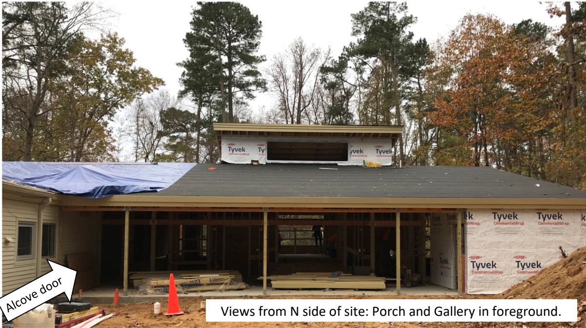
Views from N side of site: Porch and Gallery in foreground.

To see this week's video of the construction site, return to Building Project home page and click on photo with this symbol in the middle