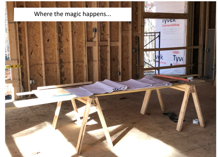
Where the magic happens...