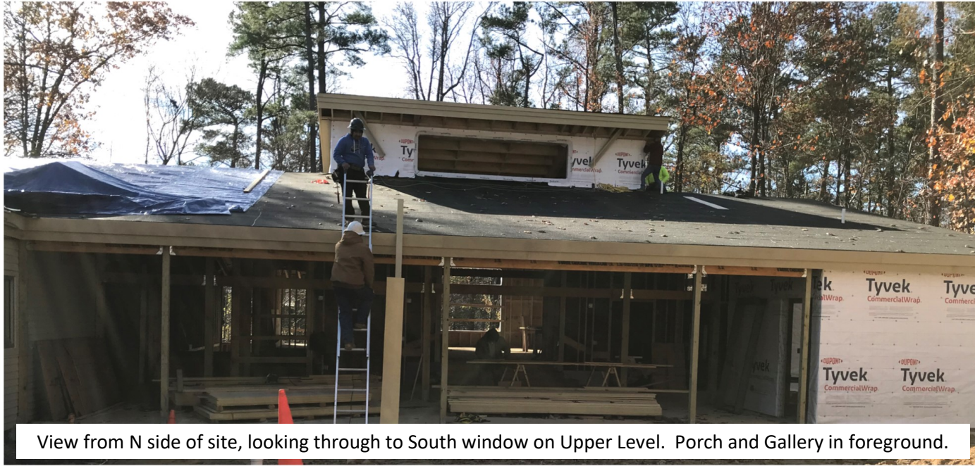
View from N side of site, looking through to South window on Upper Level. Porch and Gallery in foreground.

Going on this week: Roof-work; beginning to install exterior siding and trim; continuing to rough-in plumbing/mechanical/electrical; prep framing for hanging drywall.