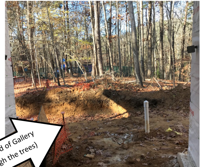
View from doorway at West end of Gallery (the upper playground, through the trees)