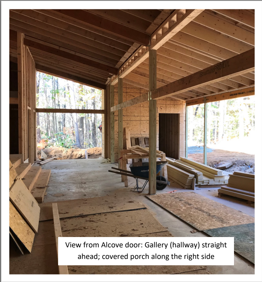
View from Alcove door: Gallery (hallway) straight ahead; covered porch along the right side