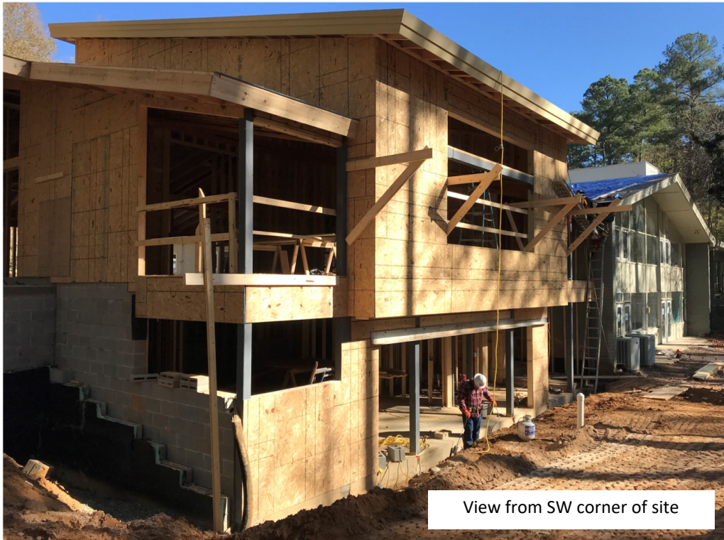
View from SW corner of site

To see this week's video of the construction site, return to Building Project home page and click on photo with this symbol in the middle