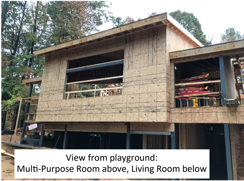
View from playground: Multi-Purpose Room above, Living Room below

To see this week's video of the construction site, return to Building Project home page and click on photo with this symbol in the middle