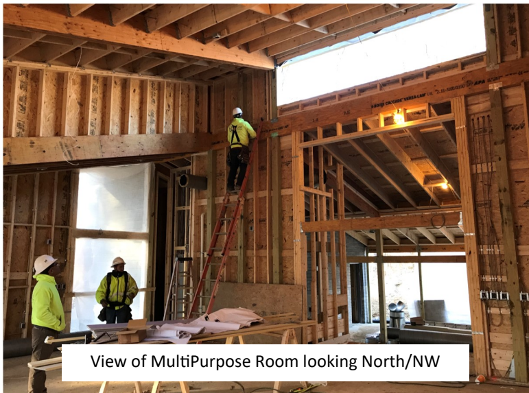
View of MultiPurpose Room looking North/NW

FIRST LOOK! From Stage Level of old building west, through the passageway to the MultiPurpose Room