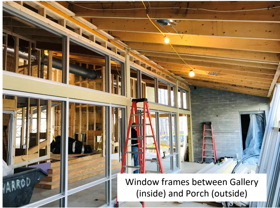
Window frames between Gallery (inside) and Porch (outside)