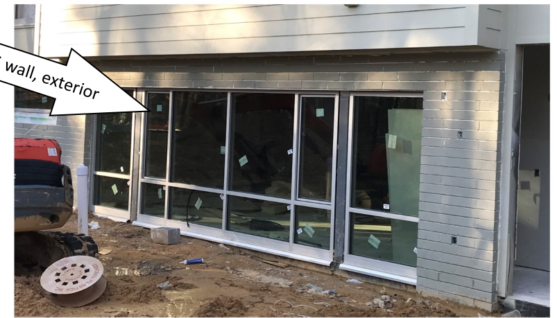
Window glass Living Room S wall, exterior