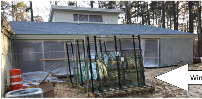
Window glass as delivered

To see this week's video of the construction site, return to Building Project home page and click on photo with this symbol in the middle.