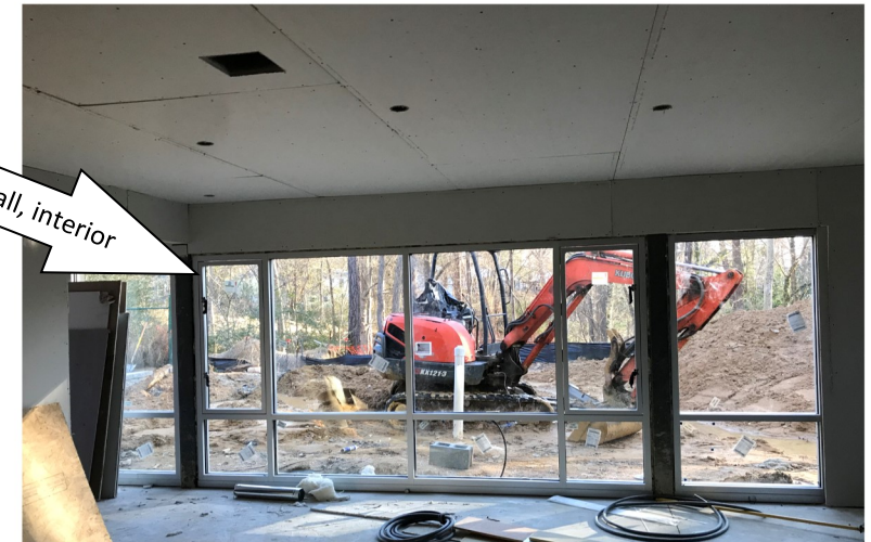
Window glass Living Room S wall, interior