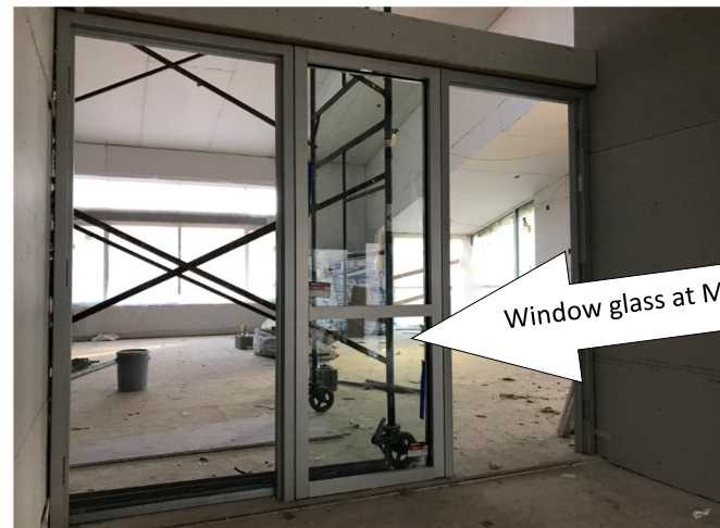
Window glass at MultiPurpose Room entrance