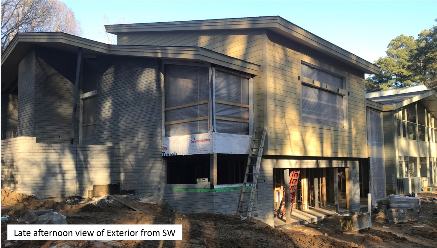
Late afternoon view of Exterior from SW

Going on this week: Nearing completion of exterior siding, trim & masonry; Interior mechanical & electrical rough-ins awaiting inspection; Walls readied for pre- sheetrock signatures