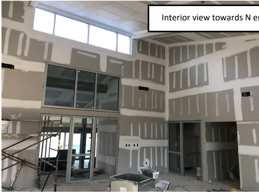
Interior view towards N end of Multi-Purpose Room