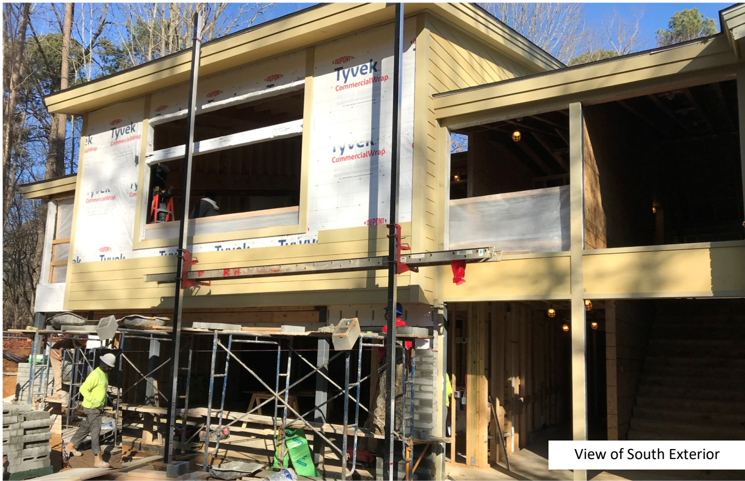
View of South Exterior