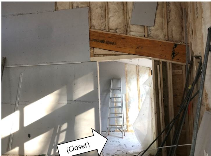
Tuesday, facing East wall of Multi-Purpose Room