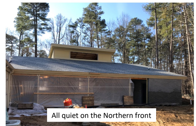
All quiet on the Northern front