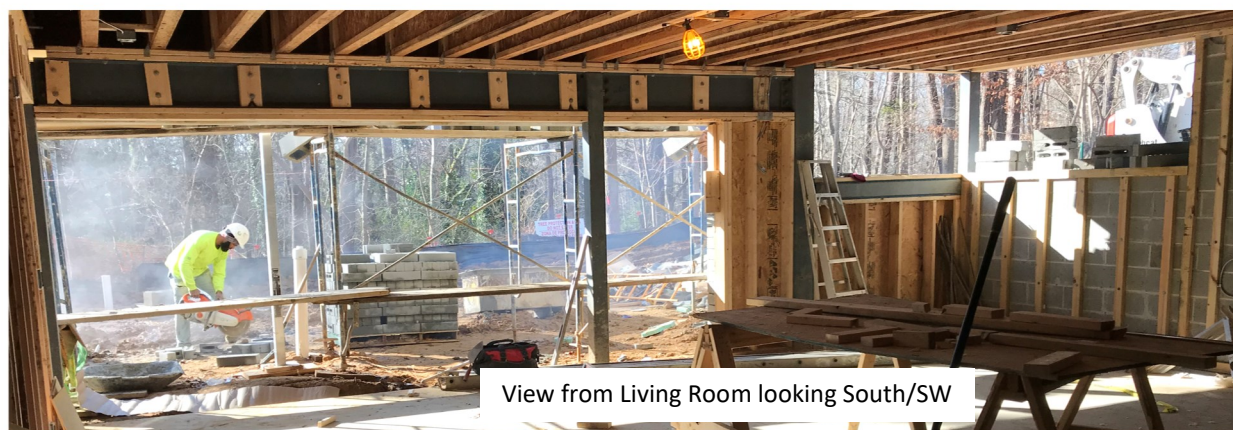
View from Living Room looking South/SW