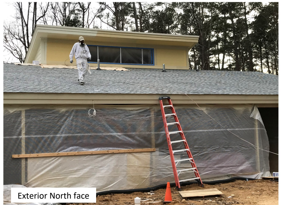
Exterior North face