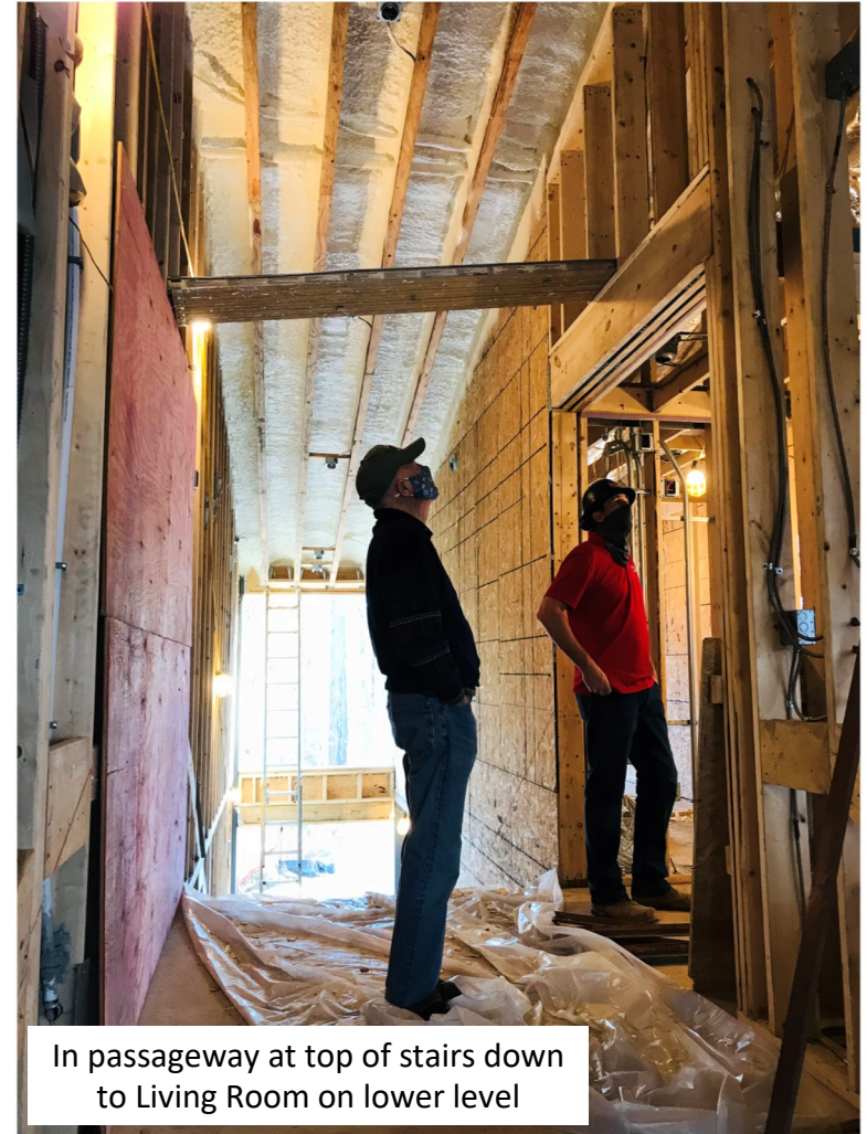
In passageway at top of stairs down to Living Room on lower level

Going on this week: Window frames! Ceiling insulation!