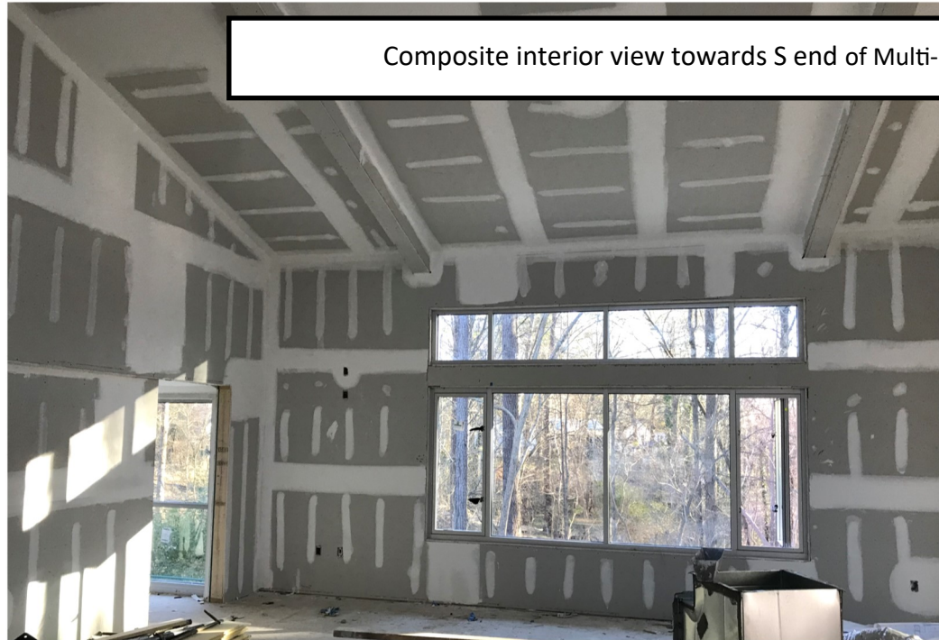
Composite interior view towards S end of Multi-Purpose Room