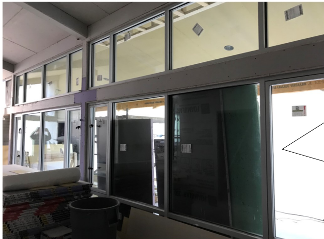
Window glass Gallery N wall

Going on this week: Window glass has been delivered and is being installed!