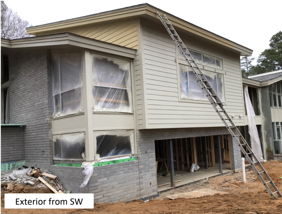
Exterior from SW

Going on this week: Wall insulation and sheetrock panels are on site, awaiting delivery of windows. Meanwhile, exterior painting under way!